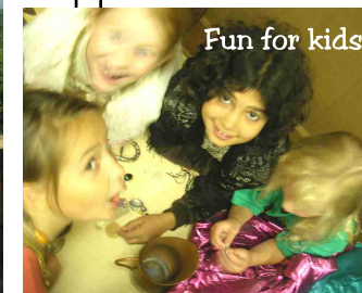
Fun for kids