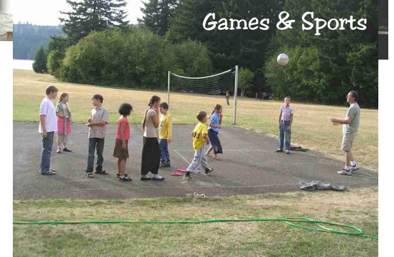
Games & Sports