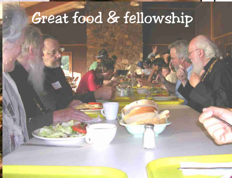
Great food & fellowship

Planned by parishioners from six Northwest parishes and four jurisdictions, the camp, inaugurated in 2000, operates with the blessing of Bishop Maxim of the Serbian Orthodox Western Diocese.